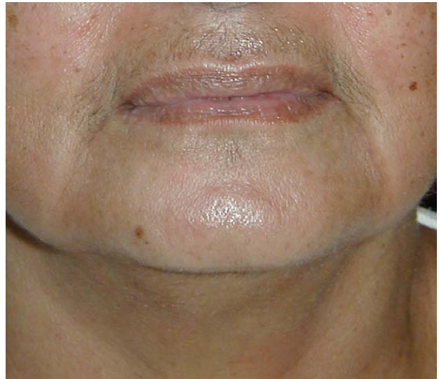
After 10 treatments: Cheeks lifted and lines are lessened. Neck is firmer also.