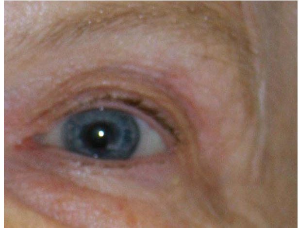
After 20 treatments: Eye lid more open and eye much brighter. Also note fading of fine lines.