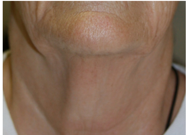
After 20 treatments: Note tightening & firming of neck and jaw line. Over all texture of skin has improved and skin color has become less reddened.