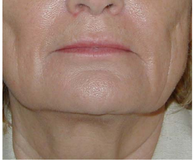
After 10 treatments: Skin texture improved. Neck firmer. Lips developing definition again. Chin less prominent. Nose has lifted.