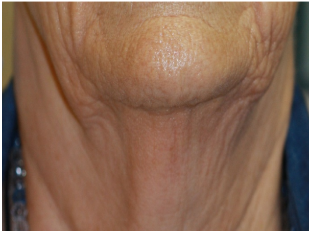
Before: complained of "turkey neck" and poor jaw line.