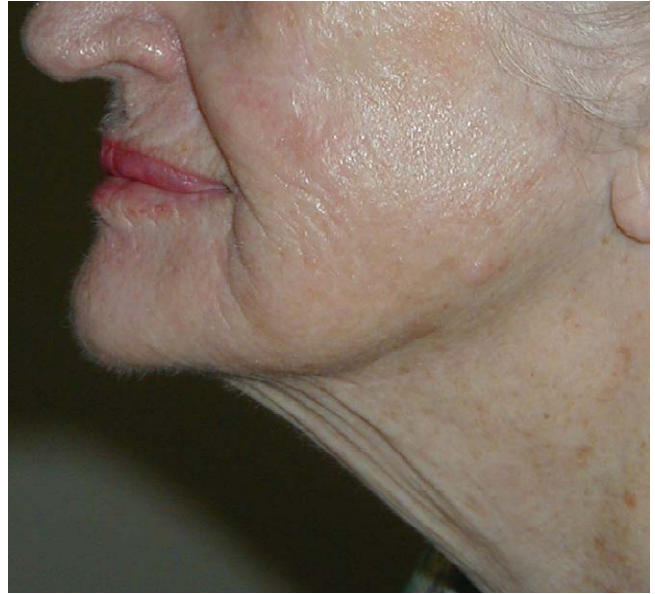
After 10 treatments: Softening of facial lines, cheek lifted, neck firmer, even nose is lifted a little.