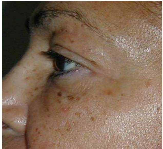
After 10 treatments: Eye overall lifted and "flattened" lower lid now normal. Fine lines are diminished also.